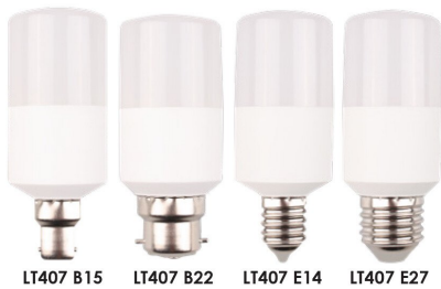
LT407 B15 LT407 B22 LT407 E14 LT407 E27