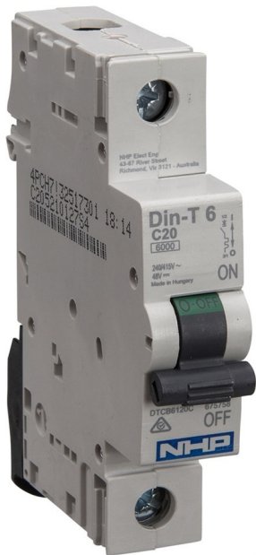
Representative Photo Only (actual product may vary based on configuration selections)