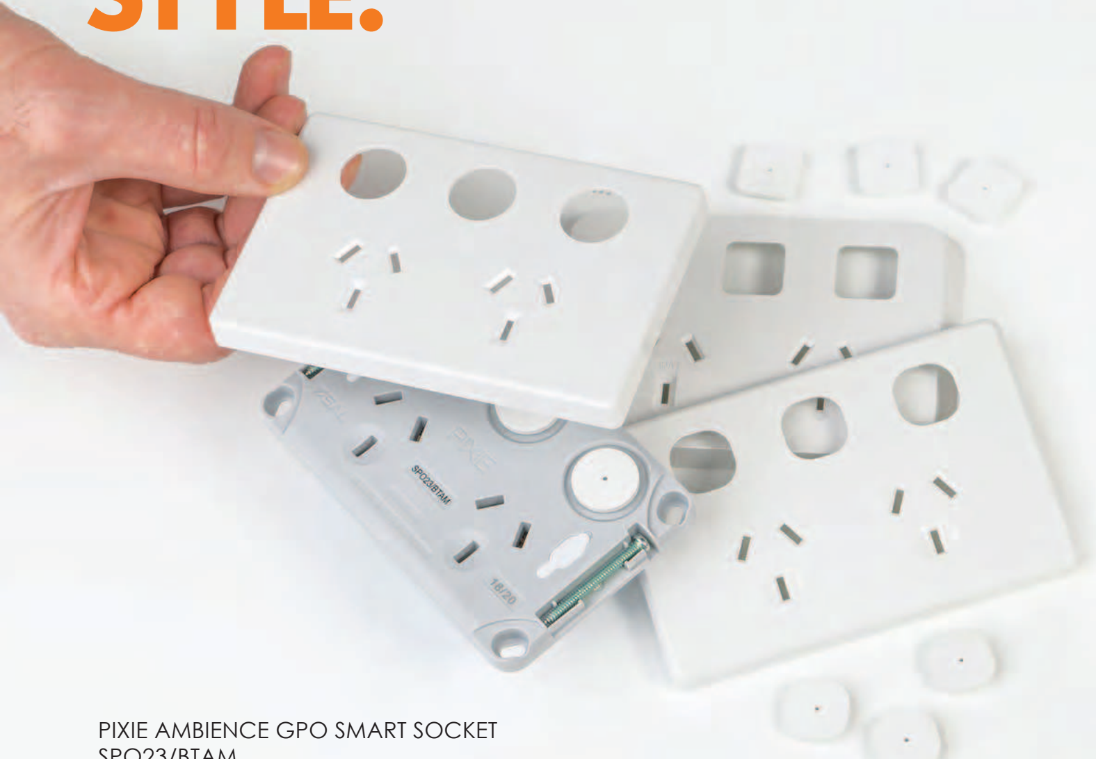
PIXIE AMBIENCE GPO SMART SOCKET SPO23/BTAM