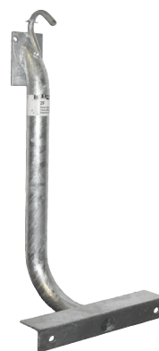
2F Fascia Mounting