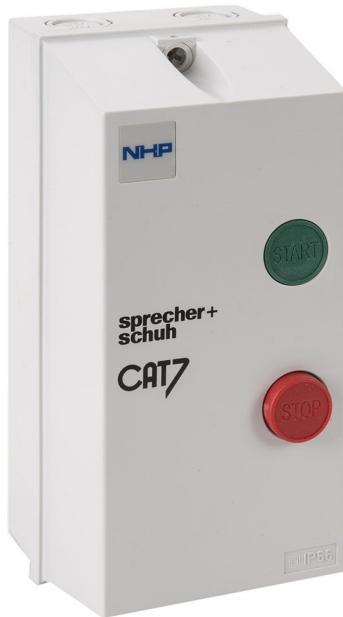
Representative Photo Only (actual product may vary based on configuration selections)

Direct On-Line Starter 7.5KW, IP66 Polycarbonate Enclosure, Controlvoltage 415 V AC, Start, Stop Pushbuttons, No Overload