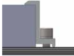
Fixing the framed panel with End Clamp